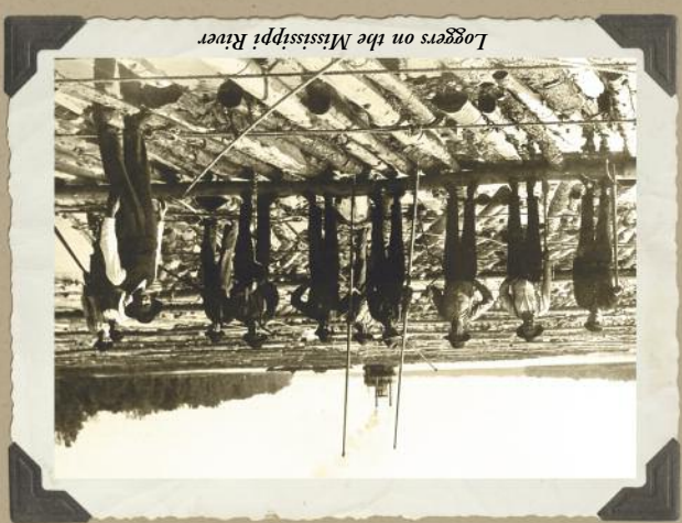
Loggers on the Mississippi River