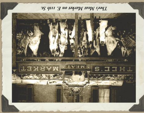
The's Meat Market on E. 11th St.