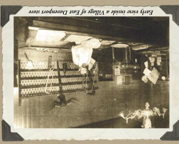
Early view inside a Village of East Davenport store