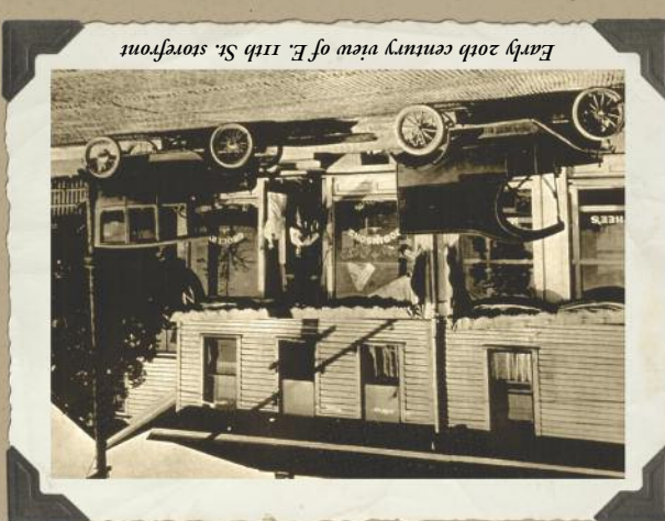
Early 20th century view of E. 11th St. storefront

Find these locations on the map inside this brochure!